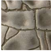
PEWTER CRACKED EARTH