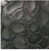
BRONZE CRACKED EARTH