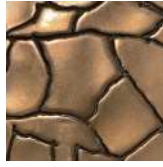
GOLD CRACKED EARTH