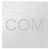
COM 2 TRIMMING