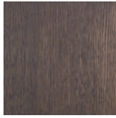
MID-BROWN OAK BASE