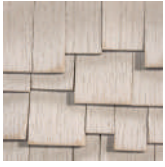
WHITE-CHIPPED OAK DRAWERS