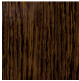
HIGH GLOSS OAK BODY