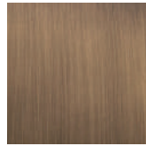
BRASS FINISH DETAILS

ALTERNATIVE FINISH COMBINATIONS AVAILABLE, SEE FBC LONDON FINISHES LOOKBOOK FOR REFERENCE OR CONTACT FBC LONDON TO SPECIFY BESPOKE FINISHES FOR YOUR ORDER.