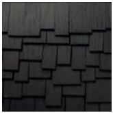
CHOCOLATE CHIPPED OAK DRAWERS