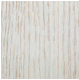
FAWN-STAINED OAK BODY