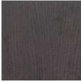
CHOCOLATE- BROWN OAK BASE