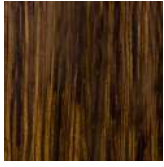
HIGH GLOSS OAK INTERNAL FRAME