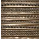
POLISHED COPPER EXTERNAL FRAME