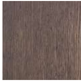
MID-BROWN OAK TOP