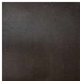
CAST BRONZE BASE