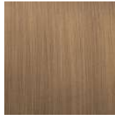
BRASS FINISH DETAILS

ALTERNATIVE FINISH COMBINATIONS AVAILABLE, SEE FBC LONDON FINISHES LOOKBOOK FOR REFERENCE OR CONTACT FBC LONDON TO SPECIFY BESPOKE FINISHES FOR YOUR ORDER.