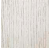
FAWN-STAINED OAK TOP