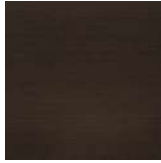
BRONZE FINISH DETAILS