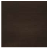
BRONZE FINISH- DETAILS