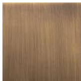
BRASS FINISH DETAILS