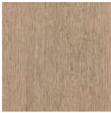
STONE-GREY OAK BASE