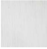
WHITE OAK BASE