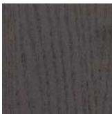
CHOCOLATE- BROWN OAK BASE