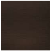
BRONZE FINISH FRAME