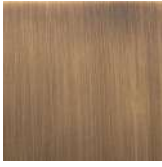
BRASS FINISH FRAME