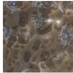
SEEDED BRONZE GLASS