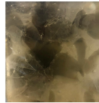
BRONZE RECYCLED GLASS