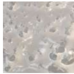
SEEDED CLEAR GLASS