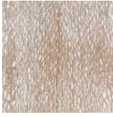
NATURAL SILKY OAK