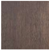
MID BROWN OAK