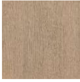
STONE GREY OAK