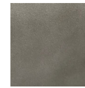
ROMAN / EVOLUTION PEWTER SO.022