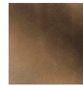
ROMAN / EVOLUTION GOLD BRONZE S.020