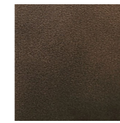
ROMAN / EVOLUTION BRONZE SO.021