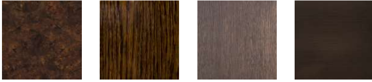
AMERICAN WALNUT BURR