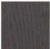
CHOCOLATE- BROWN OAK BASE