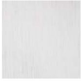
WHITE OAK BASE