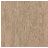
STONE-GREY OAK BASE